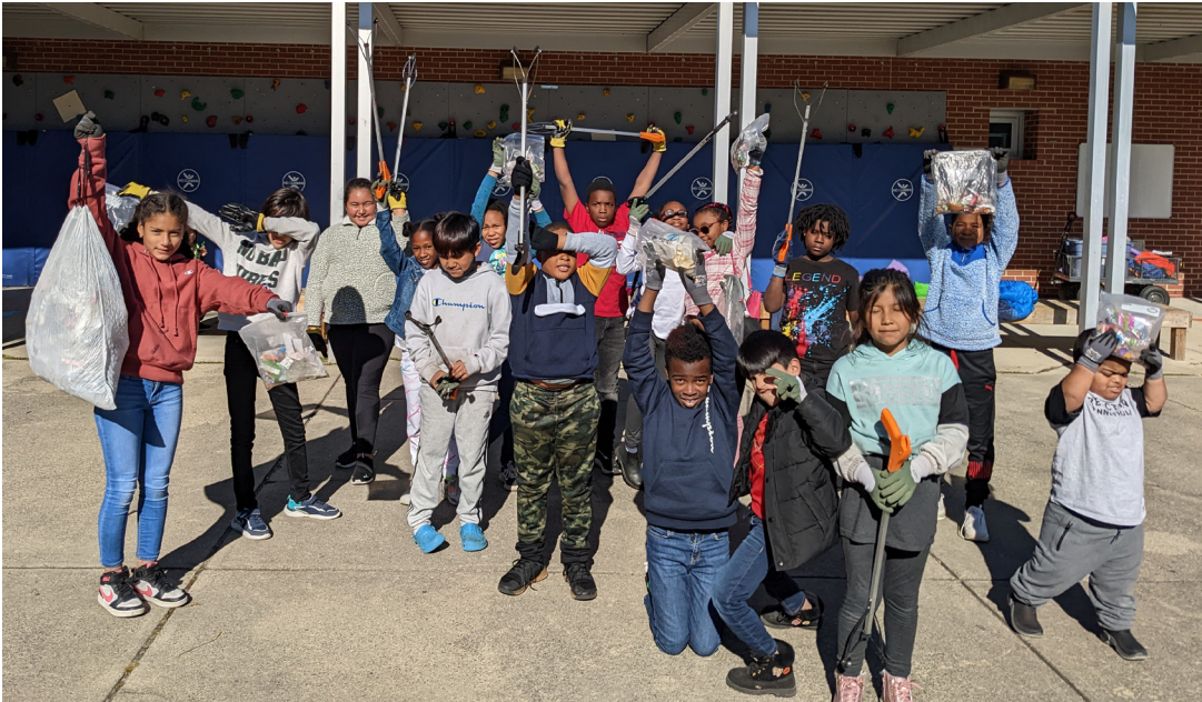
(Left) Students from Merrick-Moore Elementary School show off the litter they removed following a campus cleanup. (Next Page) Students from Lakewood Elementary and Lakewood Montessori Middle removing trash from their school grounds.

Before introducing the Litter Kits in Schools program, KDB frequently worked with Durham public, charter, and private schools and camps conducting litter prevention activities and projects on an inconsistent basis. However, the schools that often took advantage of these opportunities were primarily private or charter schools that had both the flexibility and resources to get students to the location of a service project or purchase a litter kit for their school. While we are still able to offer those kinds of opportunities to interested schools, through the Litter Kits in Schools program we are able to provide more equitable and consistent access to environmental education and outdoor service-learning opportunities.