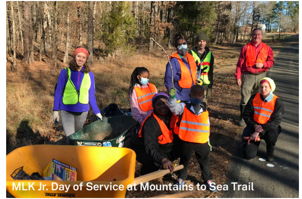
MLK Jr. Day of Service at Mountains to Sea Trail

During Earth Month, 474 volunteers picked up 7,200 pounds of trash, 1,400 pounds of recycling, and 29 tires . We also planted 31 trees and shrubs at Merrick-Moore Elementary School with students to increase biodiverse and bird-friendly habitats, did a cleanup of Geer Cemetery with Friends of Geer Cemetery, had a table with the Durham Master Gardeners at the Earth Day Festival in Central Park, led a Tree Keeper pruning workshop, and hosted a plant swap with the Glass Jug. Students at Glenn Elementary School and volunteers from Novo Nordisk also pitched in by working in community gardens and helping to green the Durham Community.