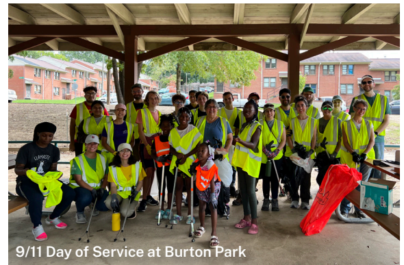
9/11 Day of Service at Burton Park