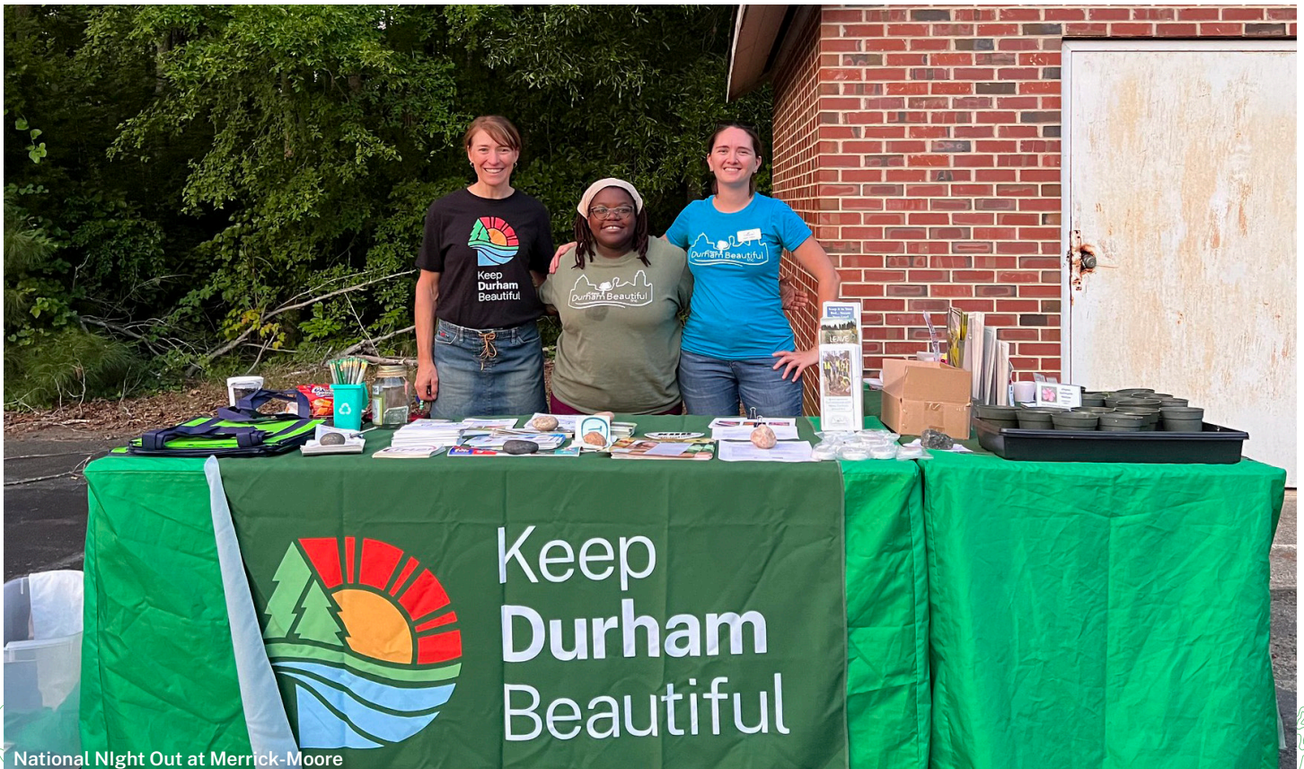
National Night Out at Merrick-Moore

We build partnerships with community groups, businesses, and organizations with similar goals to leverage resources and build an environmentally resilient, clean, and connected Durham. KDB works to bridge the equity gap among Durham's environmental groups, share volunteer opportunities, promote the work and events of our partners, and get Durham engaged and excited about stewardship of our outdoor spaces.