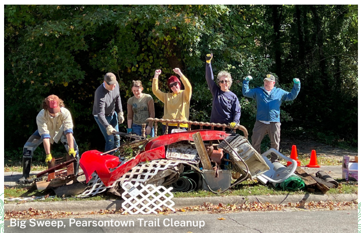
Big Sweep, Pearisontown Trail Cleanup