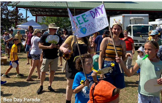
Bee Day Parade

Bee Day was a part of Durham's wider commitment to protecting native and honeybee populations. Since 2015, KDB has facilitated the multi-partner Bee City USA committee that promotes awareness, conservation, and prosperity of our native and honeybee populations in Durham County. On June 6, 2016, Durham received the official designation as a Bee City USA.