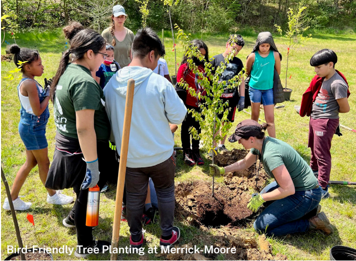
Bird-Friendly Tree Planting at Merrick-Moore

Keep Durham Beautiful works to build an environmentally resilient, clean, and inter-connected Durham through volunteerism.