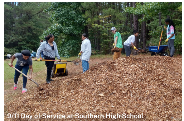
9/11 Day of Service at Southern High School