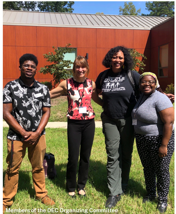
Members of the DEC Organizing Committee