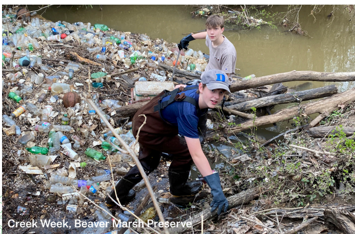
Creek Week, Beaver Marsh Preserve

Creek Week is made possible through collaboration with our partners at the City of Durham Stormwater Division, Durham County Soil and Water Conservation District, Durham Parks and Recreation, Ellerbe Creek Watershed Association, Eno River Association, Frog Hollow Outdoors, Haw River Assembly, Museum of Life and Science, North Carolina Association of Floodplain Managers, Northeast Creek Stormwatch, the Sierra Club Headwaters Group, and Two Sisters Adventure.