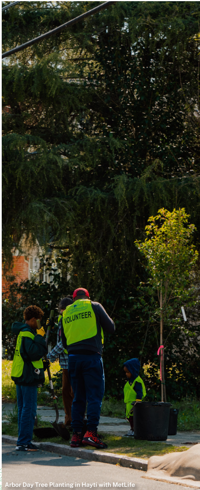
Arbor Day Tree Planting in Hayti with MetLife