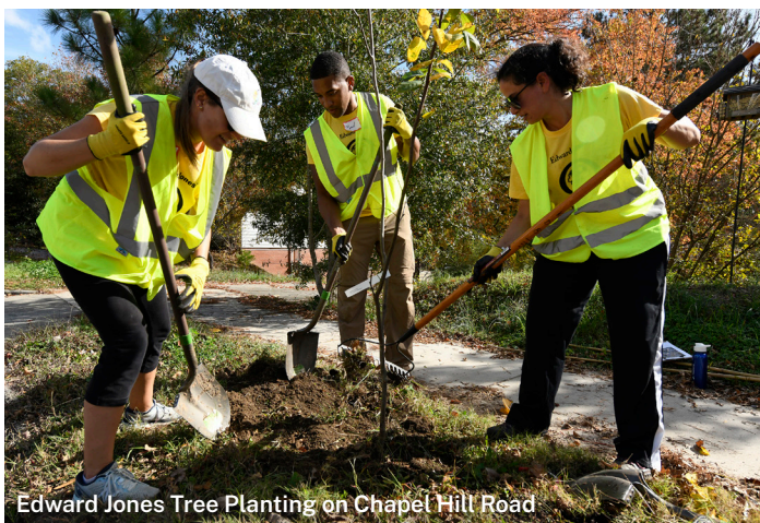
Edward Jones Tree Planting on Chapel Hill Road