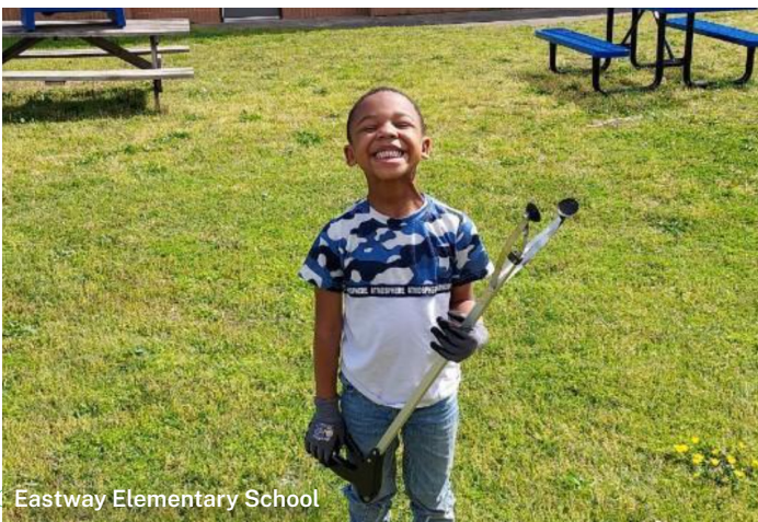
Eastway Elementary School

In just three months, from March to June, around 1,470 students in Durham participated in litter removal events and litter education at their schools. They collected 5,442 pounds of litter , and 85% of the schools noticed a positive behavior change in their students. Litter Kits in Schools continues in the 2022-2023 school year. Looking forward, we hope to expand this program to more schools, community centers, and youth groups to engage more Durham youth in litter prevention.