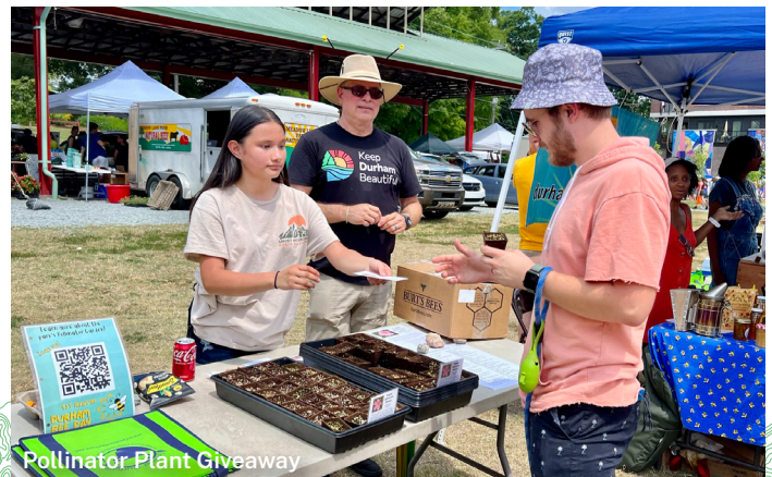
Pollinator Plant Giveaway