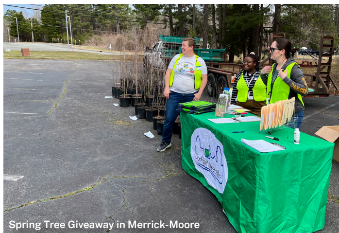
Spring Tree Giveaway in Merrick-Moore

out of the atmosphere. Native species are adapted to the climate and conditions here, so they often require less maintenance than non-native species that might be unaccustomed to North Carolina. KDB works to build resilient native habitats through our community greening programs.