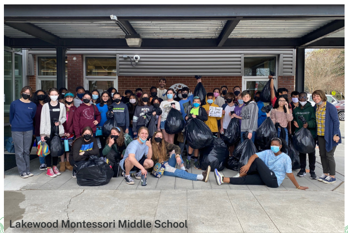
Lakewood Montessori Middle School