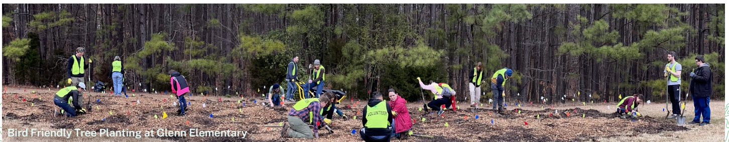
Bird Friendly Tree Planting at Glenn Elementary

Native habitats offer countless environmental benefits. Native habitats preserve and promote biodiversity; support native pollinators like birds, bees, and butterflies; and also help combat climate change by filtering carbon dioxide