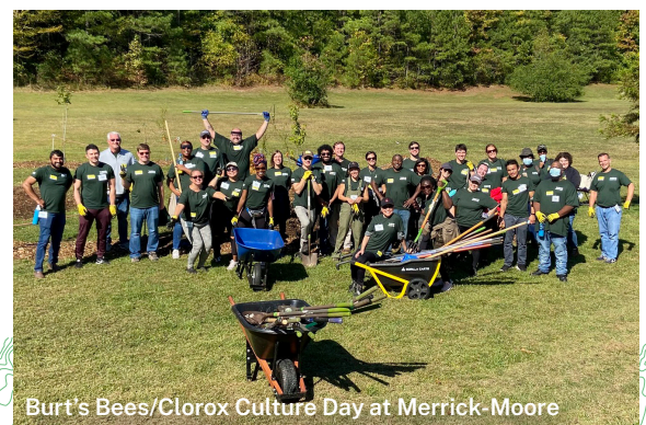
Burt's Bees/Clorox Culture Day at Merrick-Moore