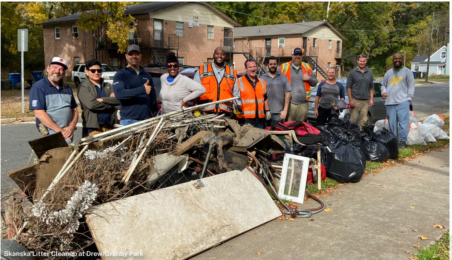
Skanska Litter Cleanup at Drew/Granby Park

At KDB, we organize community litter removal events on roadsides and waterways and focus on preventing litter and stopping it at the source. This means coordinating with local businesses and engaging youth as part of the solutions. We share why littering is harmful and find solutions that create positive impacts in the neighborhoods that need it the most. All neighborhoods and communities in Durham deserve to be beautiful, litter-free, and healthy.