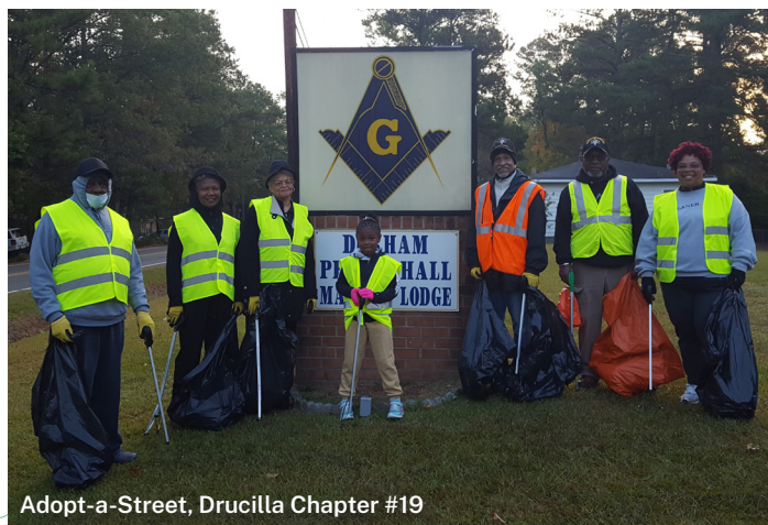
Adopt-a-Street, Drucilla Chapter #19