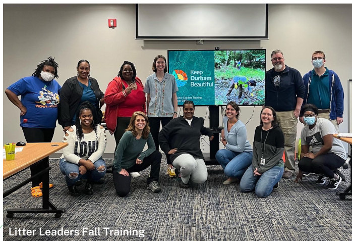
Litter Leaders Fall Training

On May 1, we hosted a community event with Wall Street Juniors to celebrate their street adoptions. Wall Street Juniors, a financial literacy nonprofit, has partnered with KDB for three years removing litter from five adopted streets in East Durham. These streets are dedicated to five community members who lost their lives to gun violence. At the celebration and service event, more than 50 participants were able to meet and learn about community groups, hear Mayor O’Neal speak about litter prevention, celebrate the community’s dedication to their adopted streets, and participate in a litter removal event.